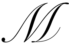
(One Letter in Snell)

Boatman Geller is not responsible for typestyle choices that do not appear correctly in a monogram. Most scripts work best in a one letter monogram. Please request a proof if you are unsure of your monogram's appearance.